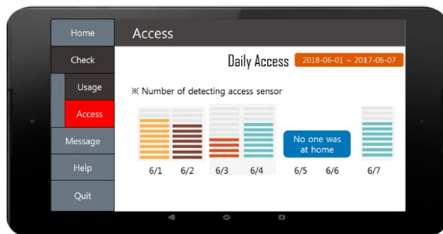
(b) Efficient Solitary Senior Citizens Care Application.