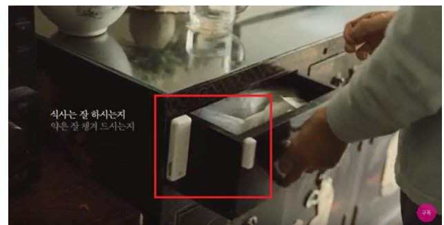
(b) Open-door notification.