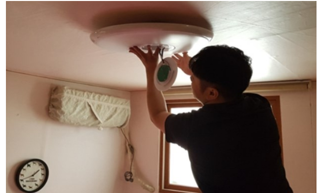
Fig. 2. Relief Care System for the Single-Living Elderly (Developed by KT).

the new regional energy activation support project implemented by the Ministry of Trade, Industry and Energy. The business agreement contract has been signed with KT and with an investment amount of 5.3 billion won including private capital, they are conducting a power generation-based profitable new & renewable energy provision project at three water purifying plants including Sangye Purification Plant.